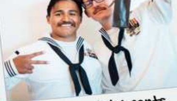
121 Financial Grants Given