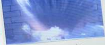
13 Podcasts Published