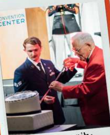
50 + Community Events