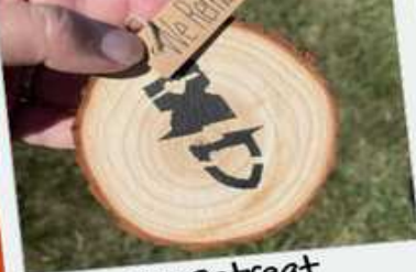
129 Retreat Participants