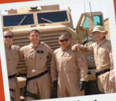
3,008 Volunteer Hours