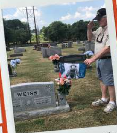
2,000 + flags placed to honor EOD warriors