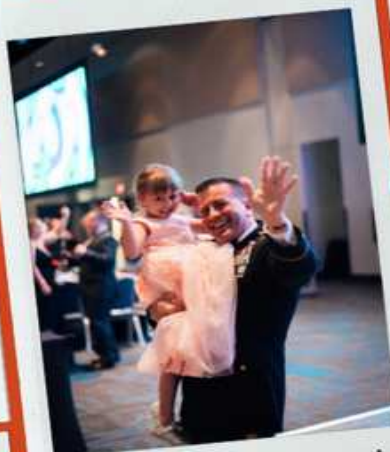
4 EOD Memorial Ceremonies held worldwide