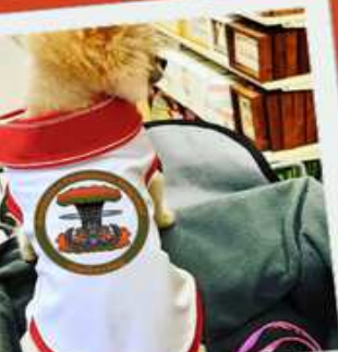
25 + EOD Monthly Gatherings