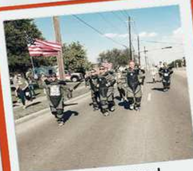
117 Undergrad Scholarships Awarded