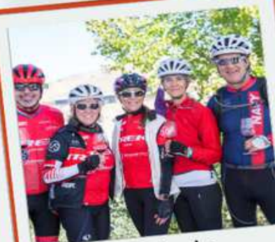
13 Graduate Scholarships Awarded