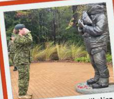
20 Transcendental Meditation Scholarships Awarded