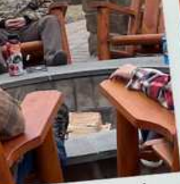
12 Retreat Programs