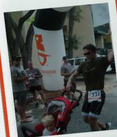
5 Removing the Stigma Events