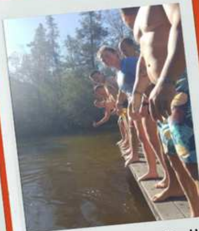
350 EOD Warriors Directly Served by Programs